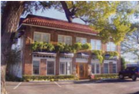
Rutherford Animal Hospital, Dallas, Texas, Estab. 1924