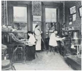
Miller-Clark Animal Hospital, New York, Estab. 1901

The American Veterinary Medical History Society is pleased to establish and sponsor the REGISTRY of Heritage Veterinary Practices to honor achievements, recognize longevity, and share information about long-standing veterinary practices in America.