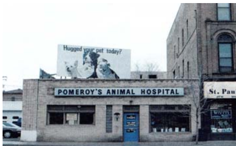
Pomeroy's Animal Hospital, St. Paul, MN, Estab. 1883

Additional heritage practices are welcome at any time.