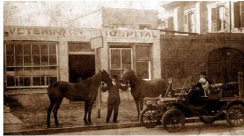
Case Veterinary Hospital, Savannah, GA, Estab. 1909